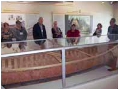
Delegates of the Meeting Places conference at Glooscap Heritage Centre and Mi'kmaw Museum