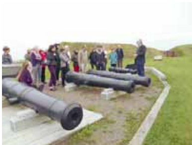
Delegates of the Meeting Places conference at Fort Beauséjour.

Conference and CSN-RÉC annual general meeting: Meeting Places: An International Canadian Studies Conference Sept 18-21, 2013. St. Mary's University, Halifax and Mount Allison University, Sackville, New Brunswick www.smu.ca/events/meetingplaces/ .