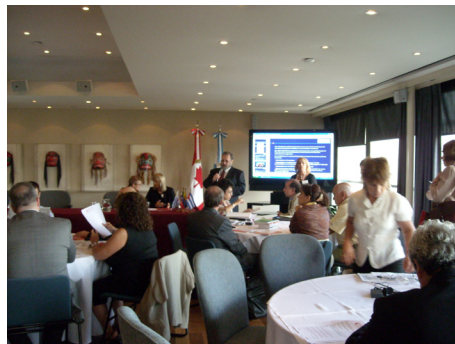
Towards Understanding Canada: Working at the Canadian Embassy in Argentina - March 27th, 2008

(agreements, important news, etc./ (accords, nouveautés, etc.)