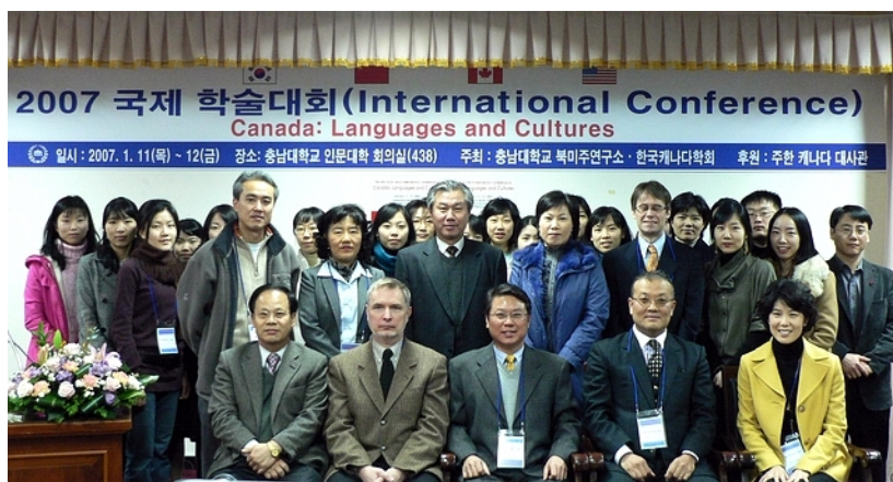
2007 KACS Spring Symposium (Jan. 12) : "Canada : Languages and Cultures"