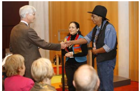
ACSN Seminar in Leiden