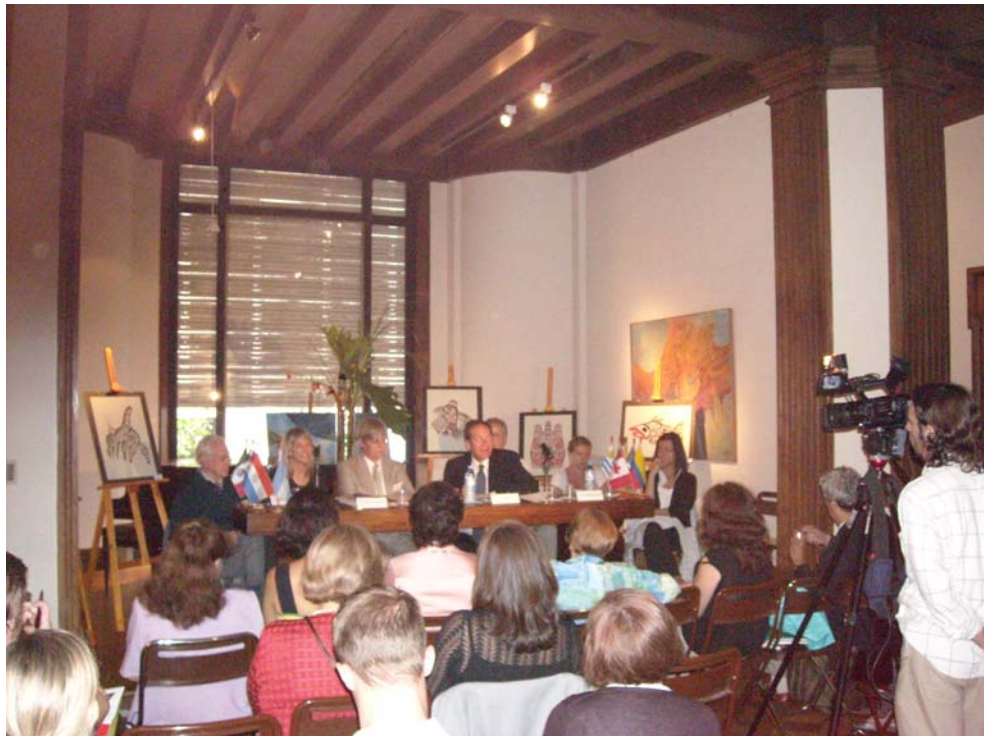
Towards Understanding Canada in the Americas